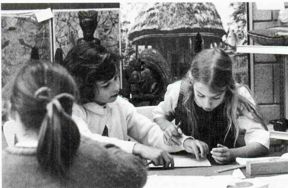
In elementary classrooms the range of student diversity is often broadened during content area lessons.

Schumm & Strickler, 1991), our research on teacher planning indicates that while such adaptations are viewed by teachers as beneficial in promoting student learning, they are often time consuming to prepare and do not fit classroom conditions (Schumm & Vaughn, 1991; Schumm, Vaughn, & Saumell, 1992a).